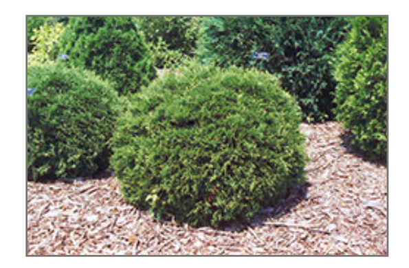
Hetz Midget Arborvitae

361 N. Hunter Highway Drums, PA 18222 (570) 788-4181 www.beechwood-gardens.com