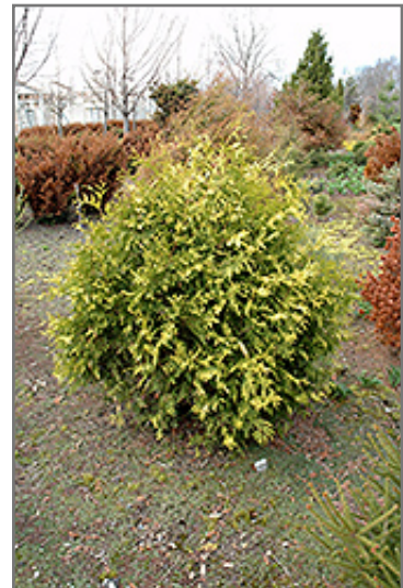
Gold Cargo Arborvitae