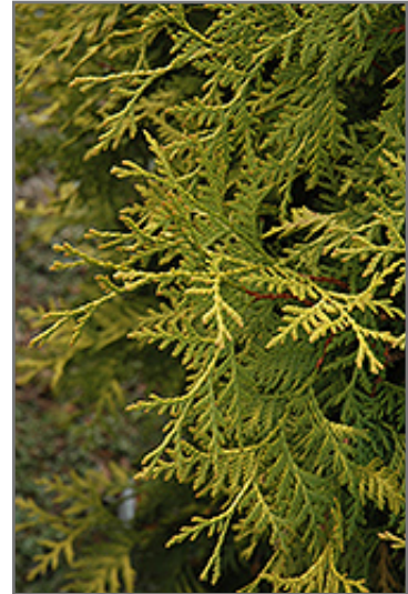
Gold Cargo Arborvitae foliage