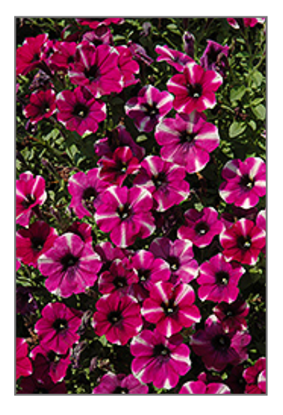
Peppy Neon Petunia flowers

361 N. Hunter Highway Drums, PA 18222 (570) 788-4181 www.beechwood-gardens.com