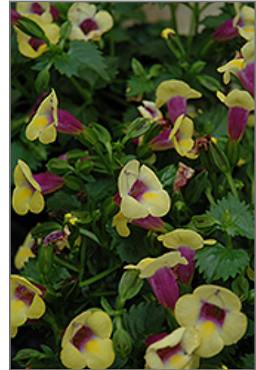
Yellow Moon Torenia flowers

Yellow Moon Torenia is recommended for the following landscape applications;