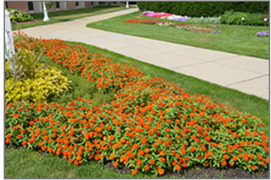
Profusion Double Fire Zinnia in bloom

* This is a 'special order' plant - contact store for details