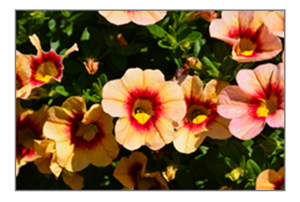
Hula Gold Calibrachoa flowers

361 N. Hunter Highway Drums, PA 18222 (570) 788-4181 www.beechwood-gardens.com