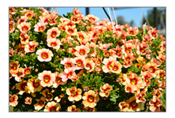
Hula Gold Calibrachoa flowers

Hula Gold Calibrachoa is recommended for the following landscape applications;