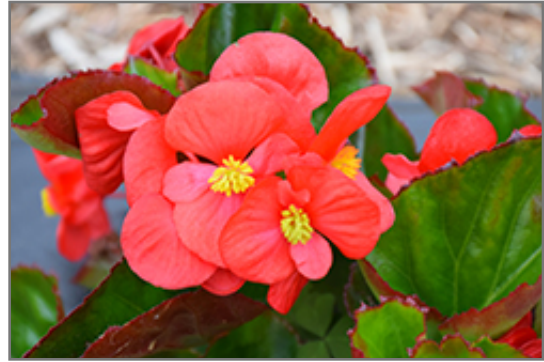
Big Red Green Leaf Begonia flowers