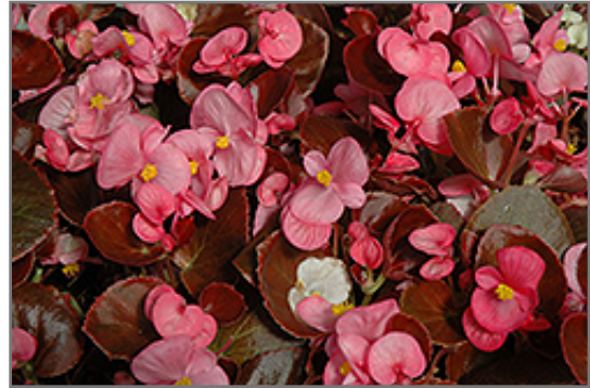
Nightife Rose Begonia flowers

Nightife Rose Begonia is recommended for the following landscape applications;