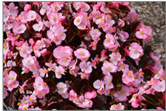
Nightife Pink Begonia flowers