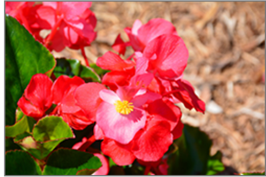
Whopper Rose Green Leaf Begonia flowers

This is a high maintenance plant that will require regular care and upkeep, and usually looks its best without pruning, although it will tolerate pruning. Deer don't particularly care for this plant and will usually leave it alone in favor of tastier treats. Gardeners should be aware of the following characteristic(s) that may warrant special consideration;