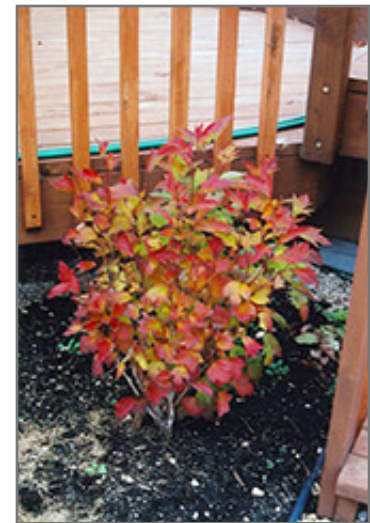
Compact Highbush Cranberry in fall