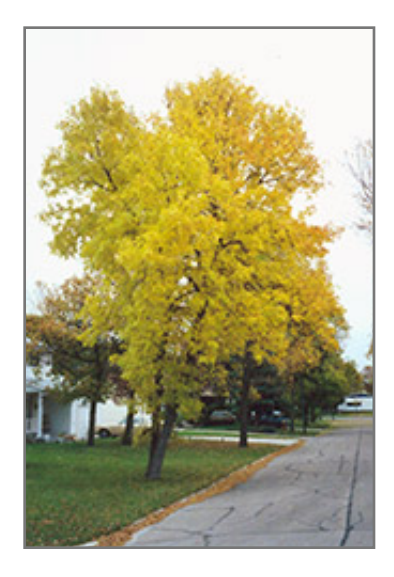
Green Ash in fall