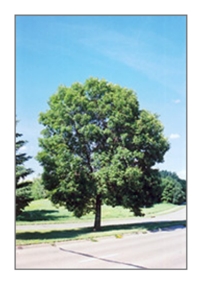
Green Ash