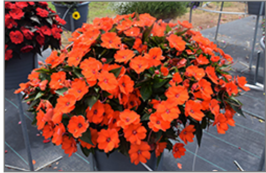
SunPatiens Compact Electric Orange New Guinea Impatiens in bloom

* This is a 'special order' plant - contact store for details