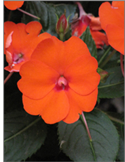
SunPatiens Compact Electric Orange New Guinea Impatiens flowers

This plant will require occasional maintenance and upkeep, and should not require much pruning, except when necessary, such as to remove dieback. It is a good choice for attracting bees and butterflies to your yard. It has no significant negative characteristics.