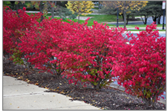
Fire Ball Burning Bush in fall

Fire Ball Burning Bush is recommended for the following landscape applications;