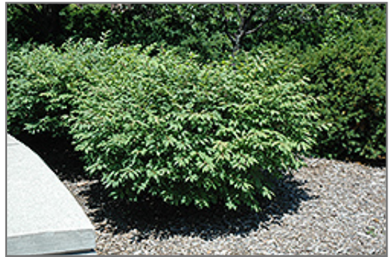
Fire Ball Burning Bush