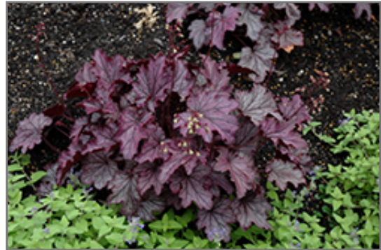
Spellbound Coral Bells