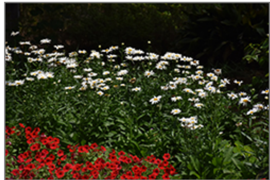
Brightside Shasta Daisy in bloom