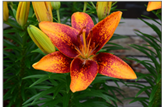
Lily Looks Tiny Orange Sensation Lily flowers