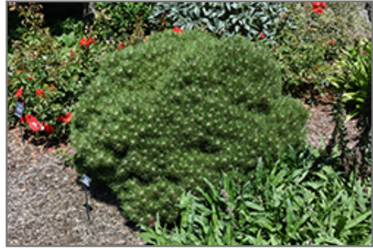
Bambino Dwarf Austrian Pine