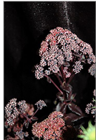
Orbit Bronze Stonecrop flowers