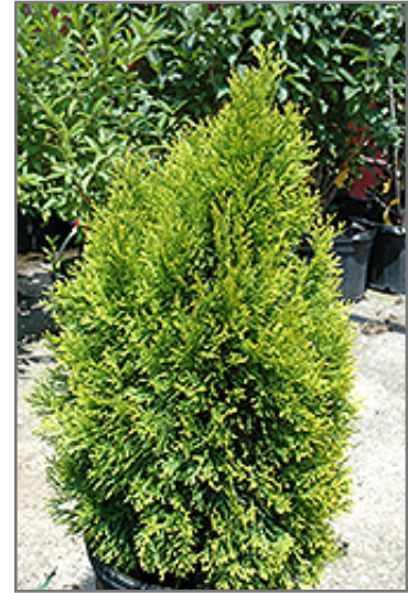
Highlights Arborvitae