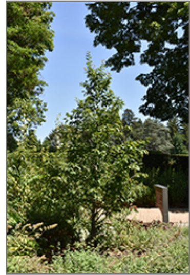
Firespire American Hornbeam

* This is a 'special order' plant - contact store for details