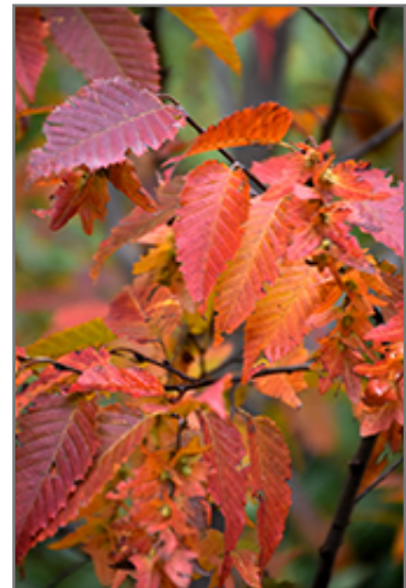
Firespire American Hornbeam in fall