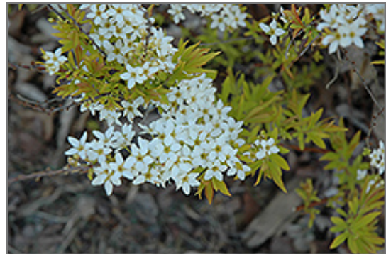
Mellow Yellow Spirea flowers