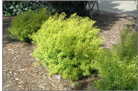
Mellow Yellow Spirea

Mellow Yellow Spirea is recommended for the following landscape applications;