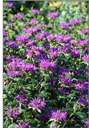
Dark Ponticum Beebalm flowers