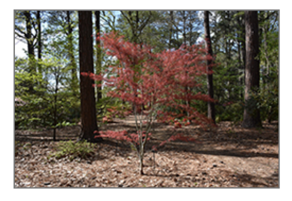
Hubb's Red Willow Japanese Maple

361 N. Hunter Highway Drums, PA 18222 (570) 788-4181 www.beechwood-gardens.com