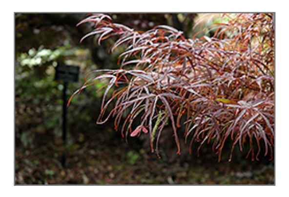
Hubb's Red Willow Japanese Maple foliage

Hubb's Red Willow Japanese Maple is recommended for the following landscape applications;