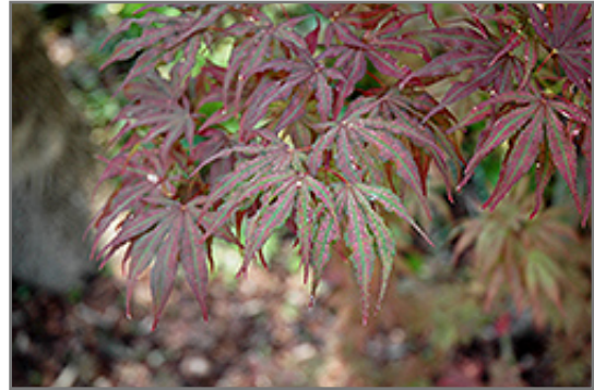
Mikazuki Japanese Maple foliage