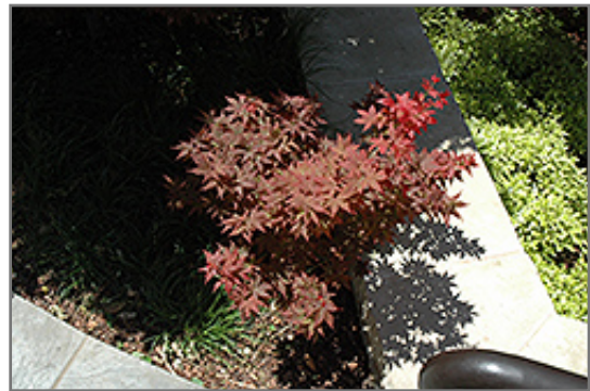
Ruby Stars Japanese Maple