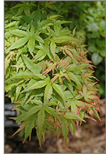
Sharp's Pygmy Japanese Maple foliage