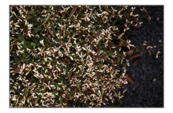
Bling Pink Princess Euphorbia flowers

361 N. Hunter Highway Drums, PA 18222 (570) 788-4181 www.beechwood-gardens.com