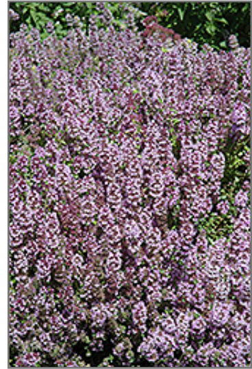
Mother-of-Thyme in bloom