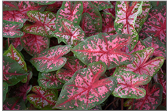
Carolyn Whorton Caladium foliage