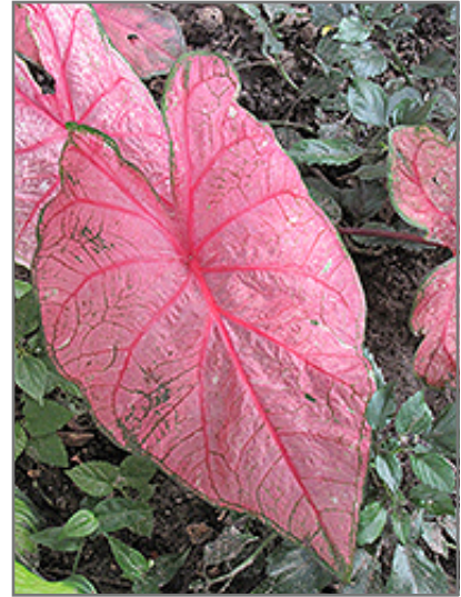
Fannie Munson Caladium foliage

Fannie Munson Caladium is recommended for the following landscape applications;