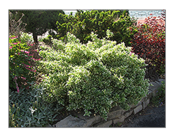
Emerald Gaiety Wintercreeper