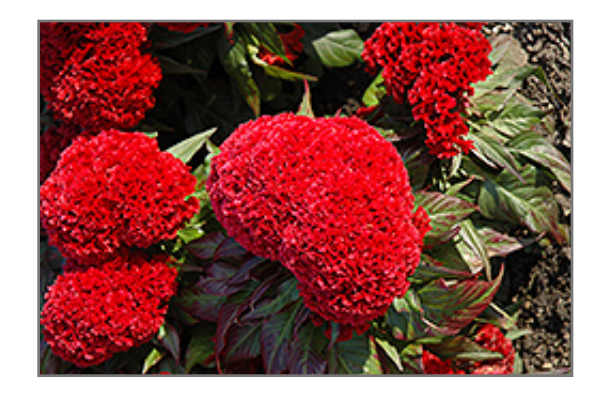
Prestige Scarlet Celosia flowers

Prestige Scarlet Celosia is recommended for the following landscape applications;