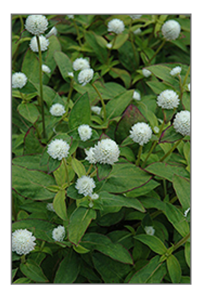
Audray White Gomphrena flowers