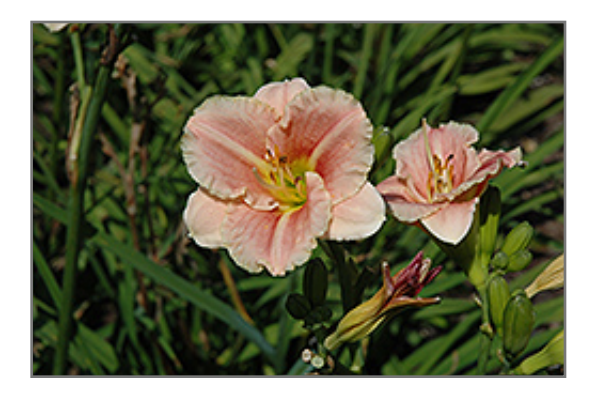
Little Anna Rosa Daylily flowers

361 N. Hunter Highway Drums, PA 18222 (570) 788-4181 www.beechwood-gardens.com