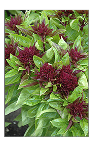
Cardinal Basil flowers

This plant is quite ornamental as well as edible, and is as much at home in a landscape or flower garden as it is in a designated herb garden. It should only be grown in full sunlight. It prefers to grow in average to moist conditions, and shouldn't be allowed to dry out. It is not particular as to soil type or pH. It is somewhat tolerant of urban pollution. This is a selected variety of a species not originally from North America. It can be propagated by cuttings; however, as a cultivated variety, be aware that it may be subject to certain restrictions or prohibitions on propagation.