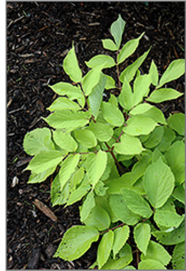
Sun King Japanese Spikenard foliage

* This is a 'special order' plant - contact store for details