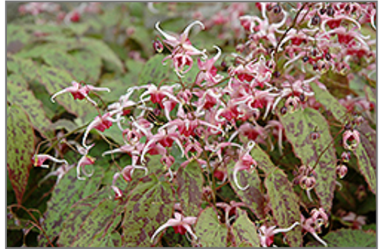
Pink Champagne Fairy Wings flowers