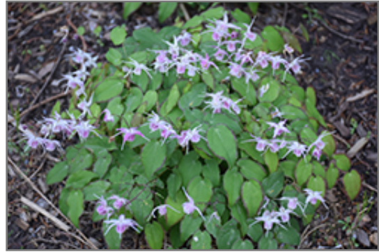
Queen Esta Bishop's Hat in bloom