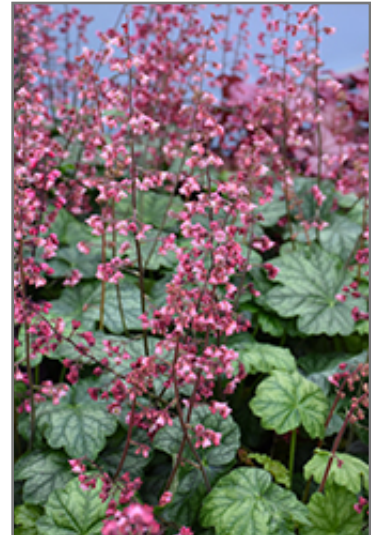
Berry Timeless Coral Bells flowers