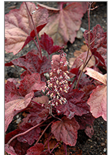
Lava Lamp Coral Bells flowers