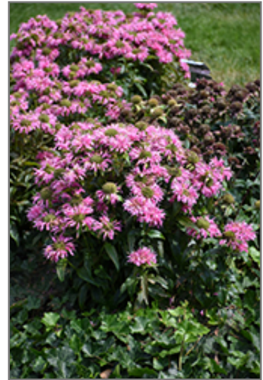
Pardon My Pink Beebalm in bloom Photo courtesy of NetPS Plant Finder