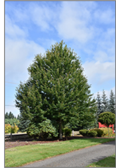
Redpointe Red Maple