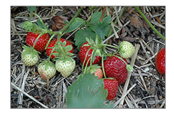
Veestar Strawberrv fruit

361 N. Hunter Highway Drums, PA 18222 (570) 788-4181 www.beechwood-gardens.com