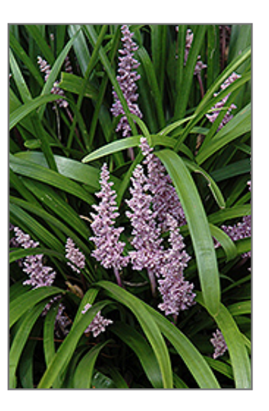
Lily Turf flowers