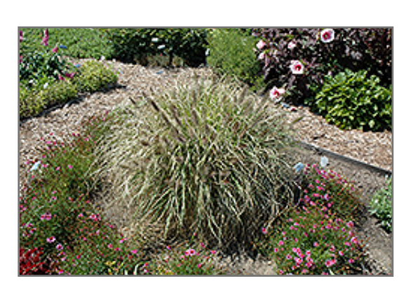
Ginger Love Fountain Grass