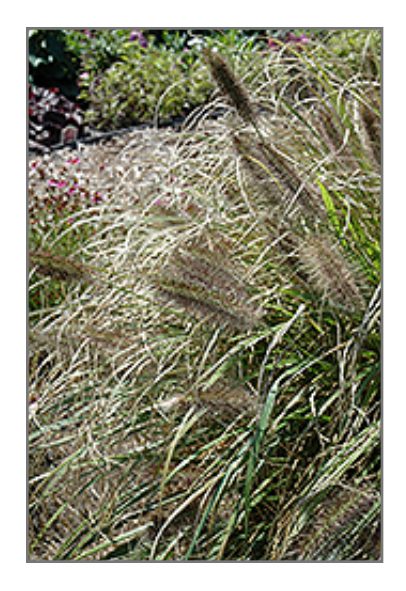
Ginger Love Fountain Grass foliage

361 N. Hunter Highway Drums, PA 18222 (570) 788-4181 www.beechwood-gardens.com