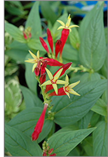
Indian Pink flowers

Indian Pink is recommended for the following landscape applications;