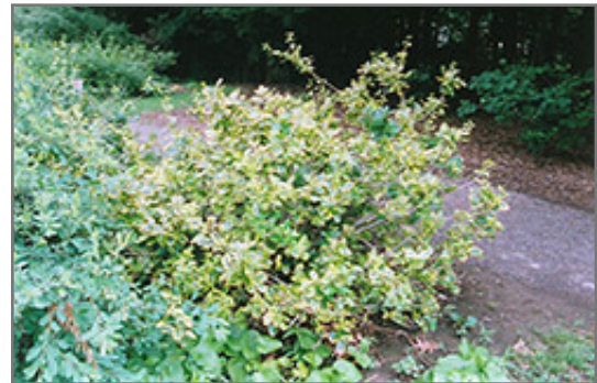
E.T. Gold Wintercreeper