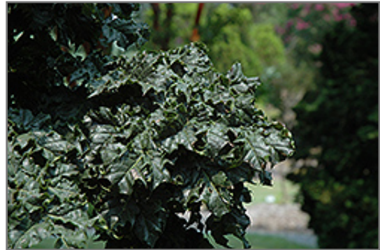
Stand Fast Norway Maple foliage