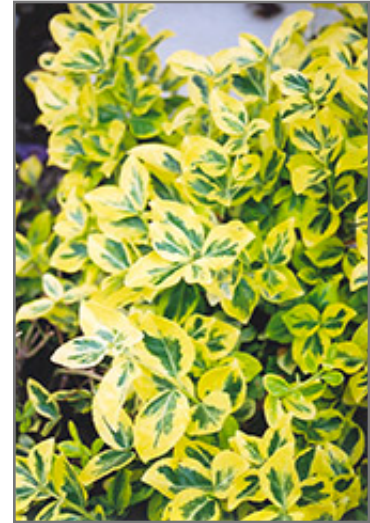
Sungold Wintercreeper foliage